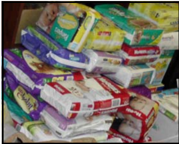
Some of the much needed "goodies" - just in time for Fall classes

The Learn Earn Plan (LEP) Program is so thankful for the wonderful donations received from the St. Theresa Life Teens and the St. Thomas Aquinas CCE teens. All of the clothing, diapers, baby wipes and other items will help as we distribute each week to our LEP clients. A big THANK YOU to all who contributed! If you have an interested in assisting in the collection of baby items, we would love to hear from you. Please call us at 281-232-2375!